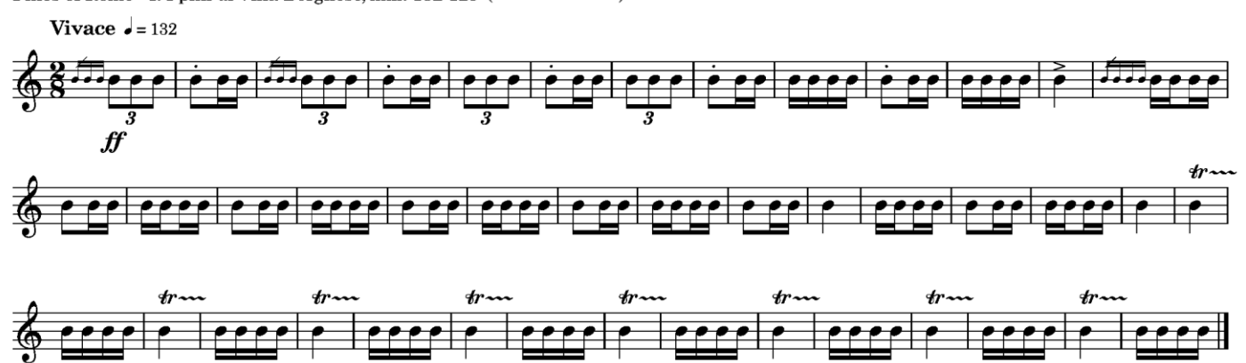
Ottorino Respighi Pines of Rome - IV. I pini della via Appia, mm. 61-78 (TIMPANI)

Ottorino Respighi Pines of Rome - I. I pini di Villa Borghese, mm. 182-125 (TAMBOURINE)